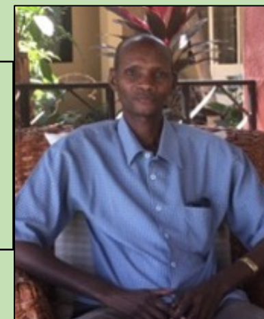
3 member GSP coach/inspector team