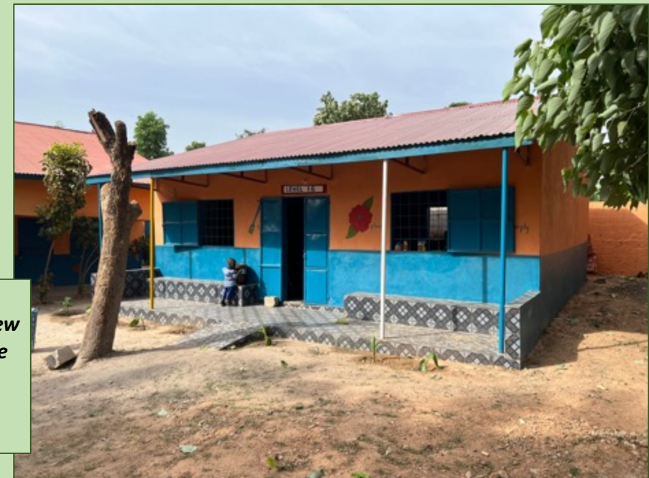
the completed classroom for a new Year 1 nursery (the mango tree will survive!) Cost £6,000