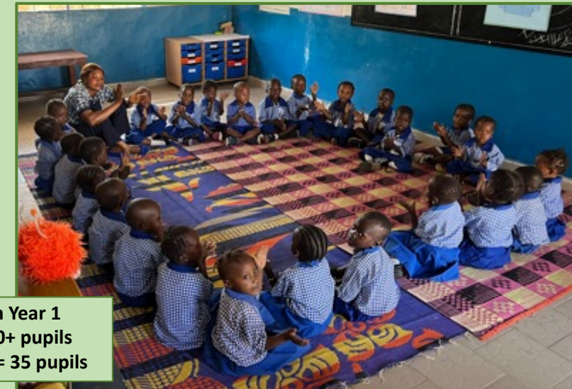
contrast between Year 1 classes. 2019 = 50+ pupils and (right) 2025 = 35 pupils