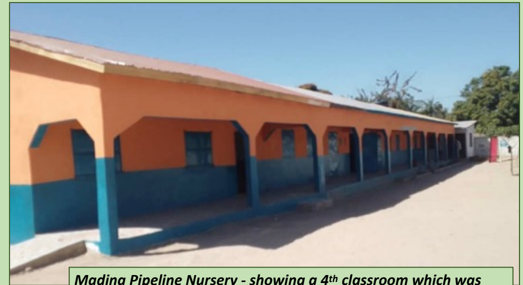
Madina Pipeline Nursery - showing a 4 th classroom which was completed in Jan 26 cost £7,750 (including a new kitchen/store)