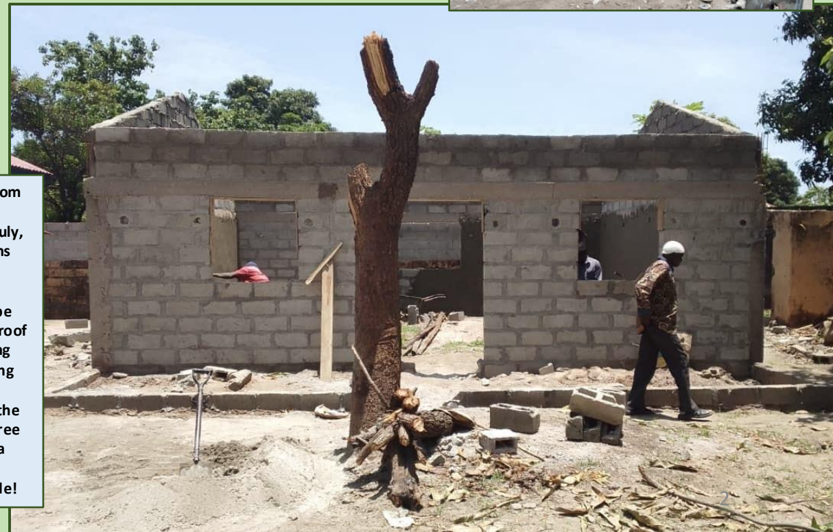
- 8mx8.5m classroom with verandah -work started 25 July, finished when rains end mid Sept - as it's the rainy season work will be paused when the roof is on, then finishing plaster and painting done next month - believe it or not the mangled Mango tree will grow back at a rate of knots and provide good shade!