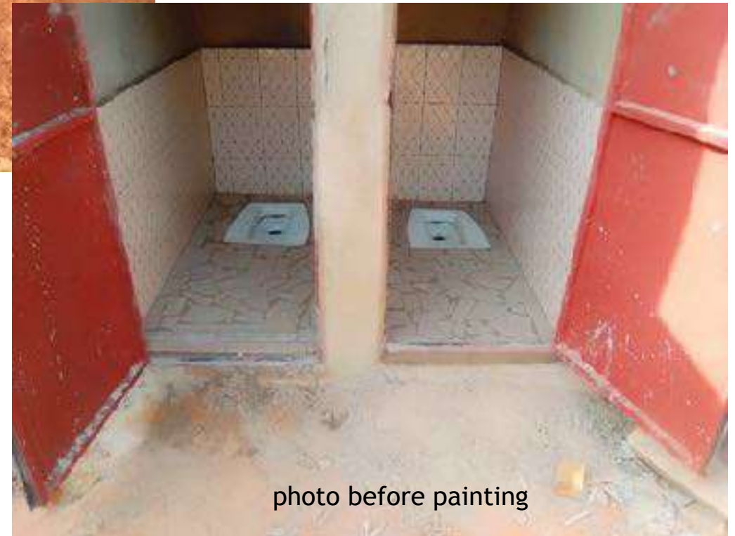
photo before painting