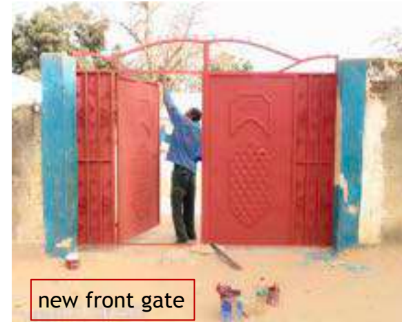
new front gate