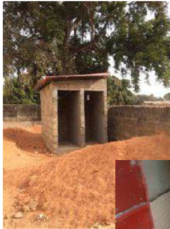
new tiled 4 cubicle, 2 front/2 back built with large cesspit