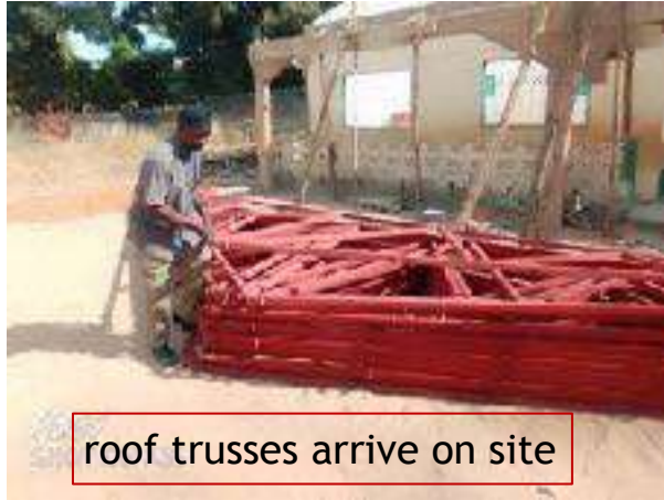
roof trusses arrive on site