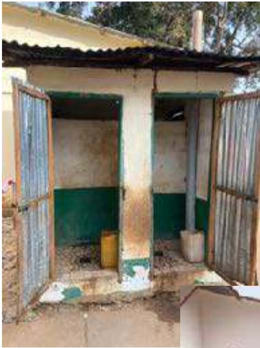
- former 3 cubicle toilet refurbished