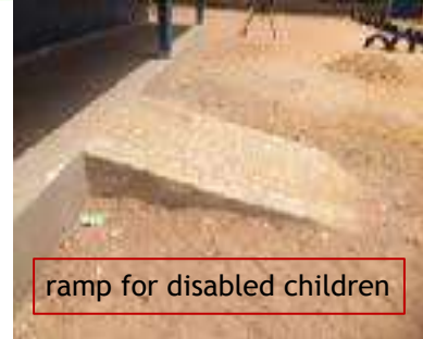
ramp for disabled children